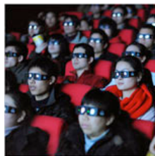
'Avatar' Burrows Into Cultural Consciousness