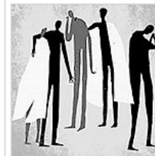
Letters: A Plea for the Stricken in Haiti