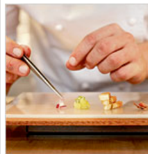
When Fingers Fumble, Chefs Turn to Tweezers